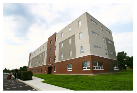
EMCC's Student Success Center offers tutoring services free of charge to our students.

EMCC provides campus housing for over 260 students.